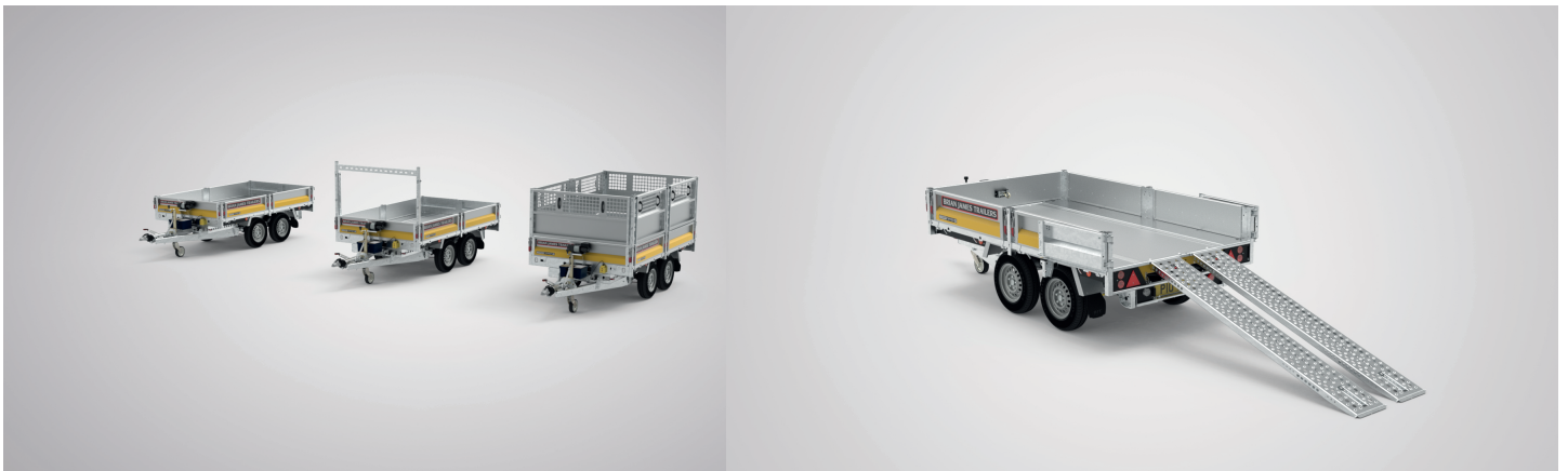
Photos show various extra options

Please Note: All trailer pricing and specifications are subject to change without notice